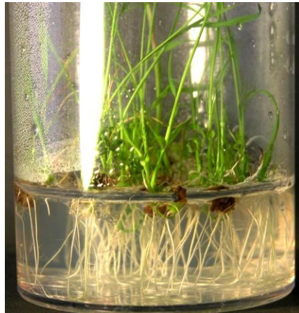
Figure 2: Roots are fully developed prior to moving plants to pots of soil

Once roots are well formed the plants are ready to be transferred into soil.